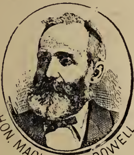
HON. MACKENZIE BOWELL.